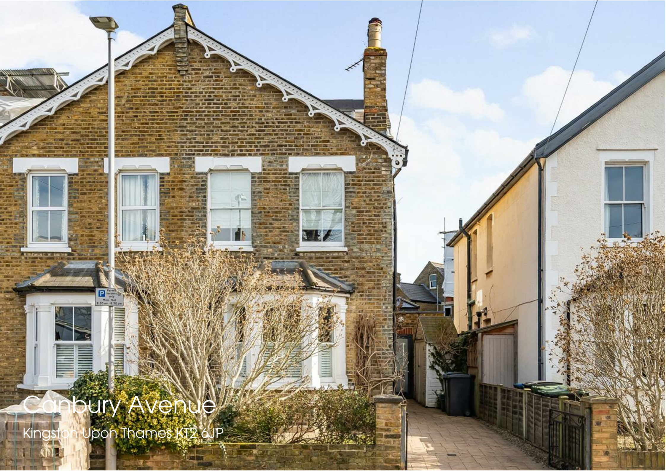
Canbury Avenue Kingston Upon Thames KT2 6JP